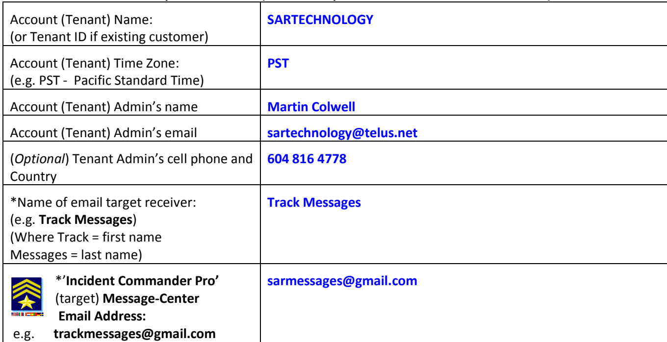
Table 1 - Basic account setup information: (* denotes specific to 'Incident Commander Pro')